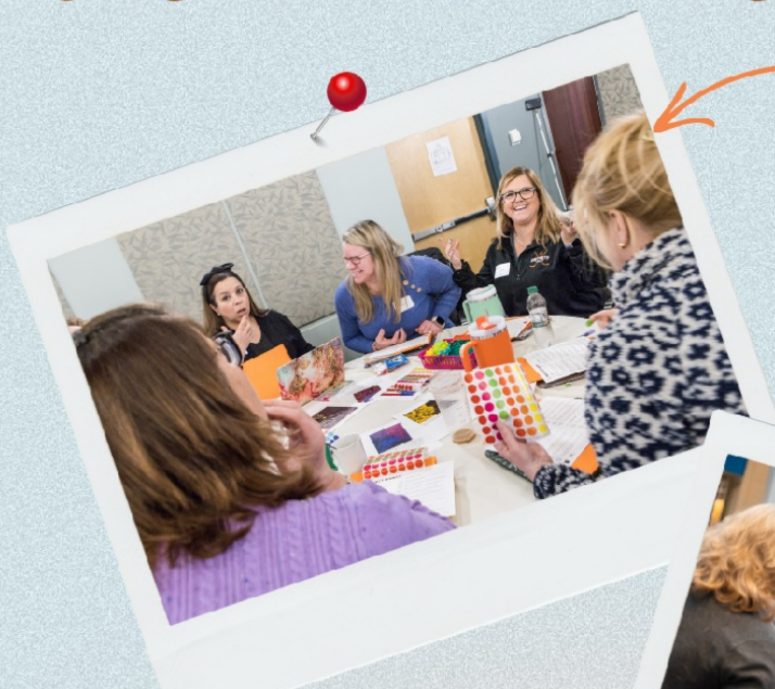
2/8/24: Winter Gathering The Project Habit: Designing for Rigor with Project-Based Learning