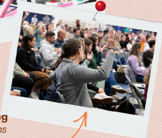
11/5/24: Fall Gathering Conversations we need to have (but often avoid)